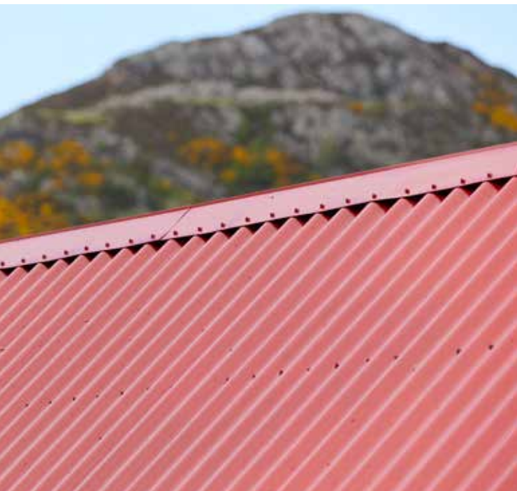
PHOTOS FERNAIG COTTAGE: AI REY SPACES, ARCHITECTURAL PHOTOGRAPHY; COPYRIGHT: SSAB

PROJECT: WESTER ROSS, SCOTLAND, UK »FERNAIG COTTAGE«