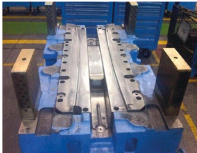
Pic.2: No segment (monoblock) on drawing edge.